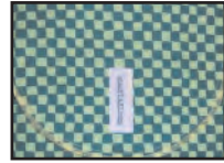
Taxi Check Spearmint